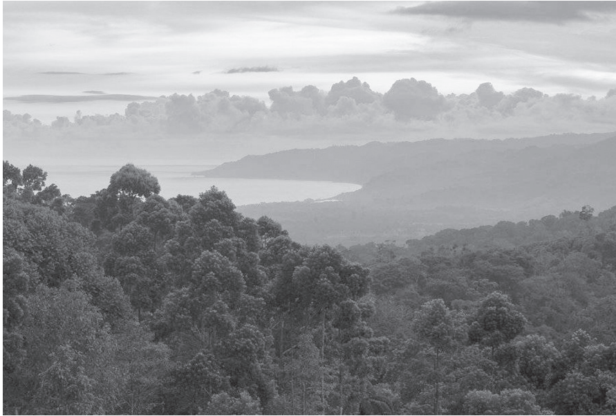
Figure 2. The Pacific Ocean from Cerro Osa.

quires an organic, multi-faceted approach to conservation of the peninsula's 13 distinct ecosystems. Sound science provides the foundation for their efforts, the core of which includes establishment of a protected area network buttressed by community and government support.